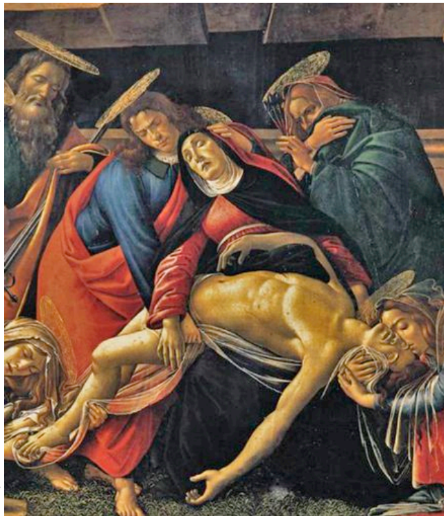
Sandro Botticelli, Lamentation over the Dead Christ with Saints c. 1490

Sandro Botticelli's, Lament , shown here, captures this mother's grief in a moving and passionate way. Here Mary has swooned, her grief so deep, her loss so great. The overwhelming finality of holding her dead son in her arms is too much to bear.